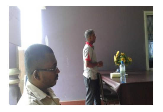
Awareness for Civil Communities