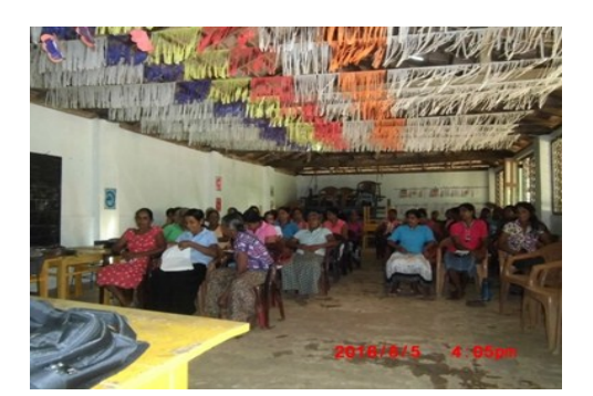
Awareness for Divineguma Dos