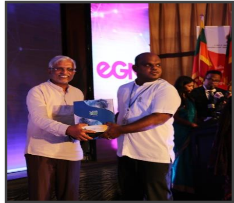
Providing tablet and computer accessories for Grama Niladharis (2017.03.23)